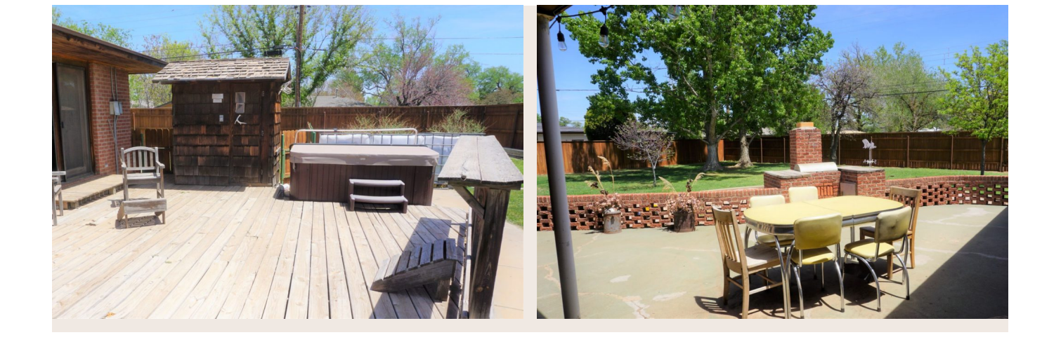
@2025 \; Glenn \; Cummings \; Real \; Estate \; | \; \underline{LandBrokerWebsites.com}