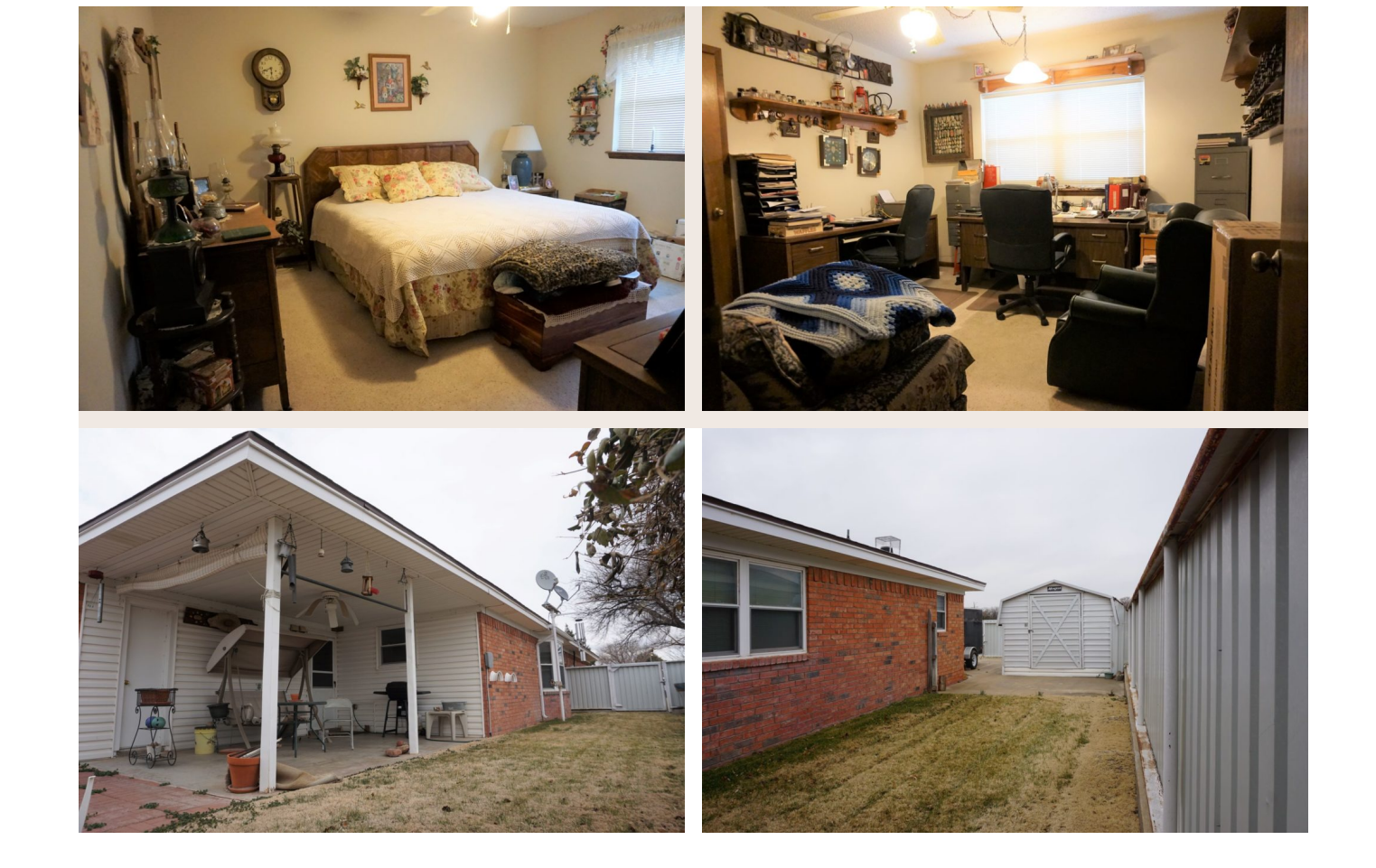
© 2025 Glenn Cummings Real Estate | LandBrokerWebsites.com