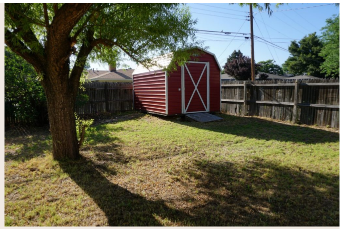
@2025 \; Glenn \; Cummings \; Real \; Estate \; | \; \underline{\text{LandBrokerWebsites.com}}