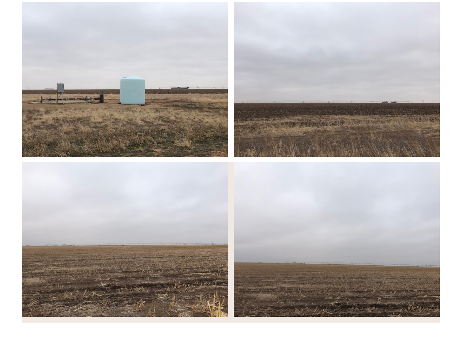
@2025 \ Glenn \ Cummings \ Real \ Estate \ | \ \underline{\text{LandBrokerWebsites.com}}